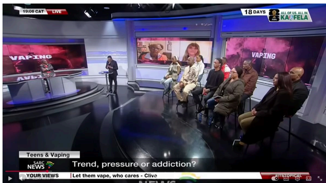
It's Topical | Is there underage vaping crisis?